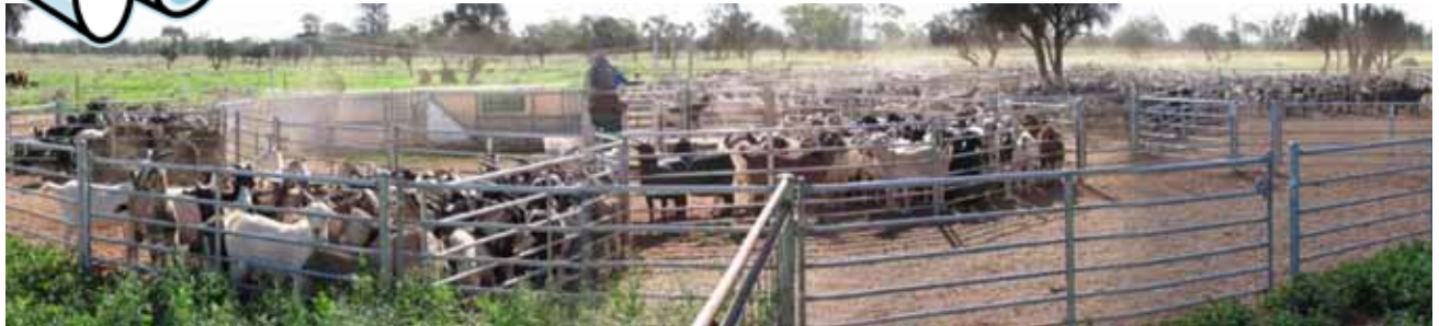
The Prattley yards we built at Etiwanda in 2008 - handle sheep and goats no worries – they have been a great investment!