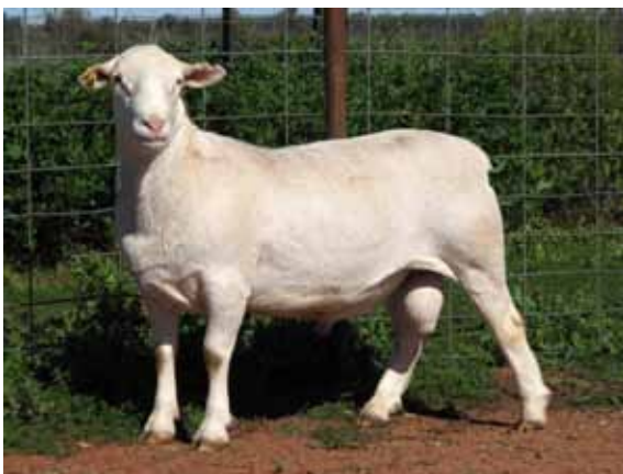
ETIWANDA E5104 – Lot 1 National Sale

For more info on these rams, including ASBV's please visit our latest news item Etiwanda 2010 National Sale Ram Team on our website www.etiwanda.com.au