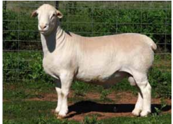
ETIWANDA E5503 – Lot 6 National Sale