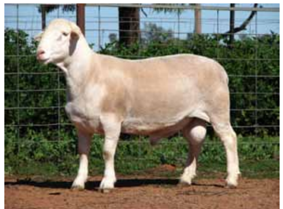
ETIWANDA E5206 – Lot 2 National Sale