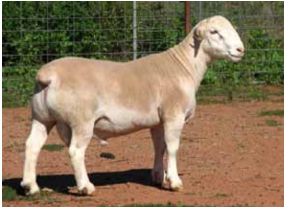
ETIWANDA E5352 – Lot 5 National Sale