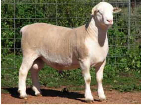
ETIWANDA E5429 – Lot 3 National Sale