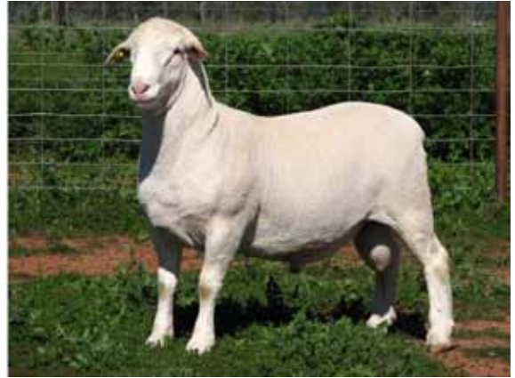
ETIWANDA E5319 – Lot 4 National Sale