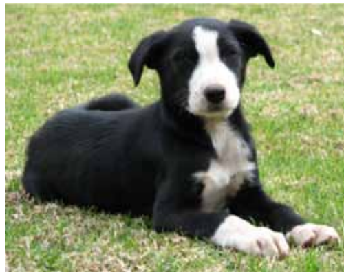
Belle - left, Max - Top

We have 2 short haired Border collie pups for sale (DOB June 7th) – 1 tri-coloured female and 1 black and white male. Both parents are Andrew's main dogs and are used regularly on cattle, sheep and goats. 9 days out of 10 they are very handy! These pups are vaccinated and we are asking $440.00 Inc GST for them.