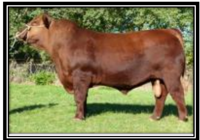
We paid $9000.00 for Tullatoola Redman H121 at the Red Angus National.

Early in the holidays we travelled to Dubbo to The Red Angus National Show and Sale and purchased Tullatoola Redman H121 to join to the Etiwanda heifers. Redman is from a long line of easy calving genetics, he is superbly quiet and well-muscled young bull. He has a wonderful set of balanced figures – moderate growth, well above average muscle, positive fat & easy calving – just the ticket for our rangeland production system and pasture finishing. Andrew is toying with the idea of selling Rangeland Ready bulls, as we see a need for that type of breeding bull out in Western NSW. If you think you might be interested in Rangeland Ready bulls we would be keen to hear about your requirements.